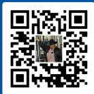
Dean's - QR Contact